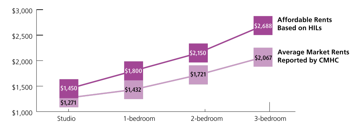
BC Housing's Housing Income Limits and CMHC Average Market Rents Compared

For a single person with an intellectual or developmental disability, there is a significant gap between the amount of rent that they can afford to pay based on their income and the average cost of housing with more than 5,000 people with intellectual and developmental disabilities looking for affordable homes in British Columbia.